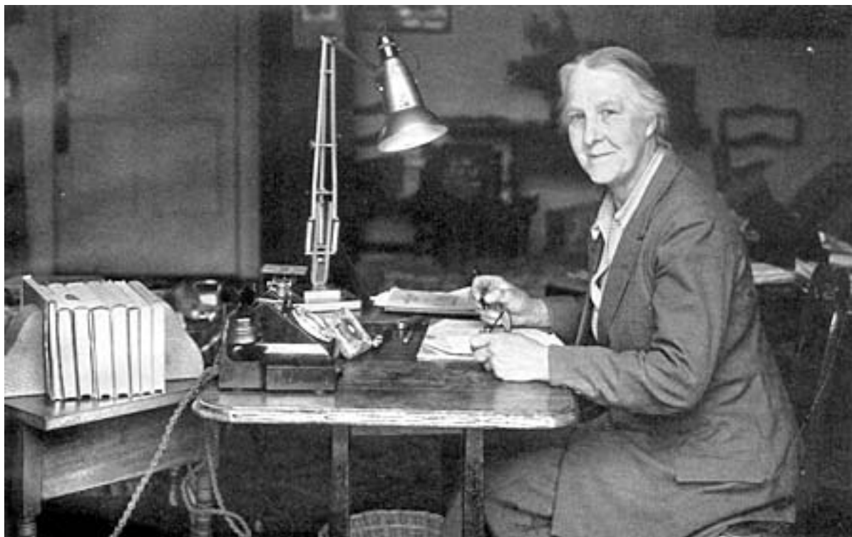
Plate 1: Portrait of the author

This book describes a way of making compost, i.e. humus, which is simply, labour saving (no turning) and quick, both in ripening the compost and in getting results in the soil. It is adaptable to all conditions and to every size and type of garden, allotment or farm, the process being based on nature's own methods.