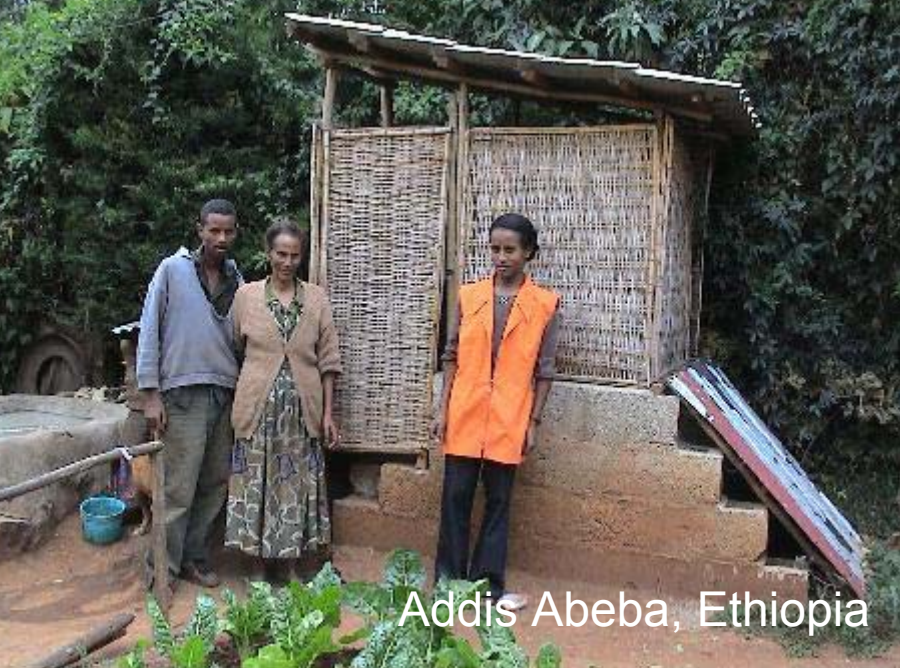
Addis Abeba, Ethiopia