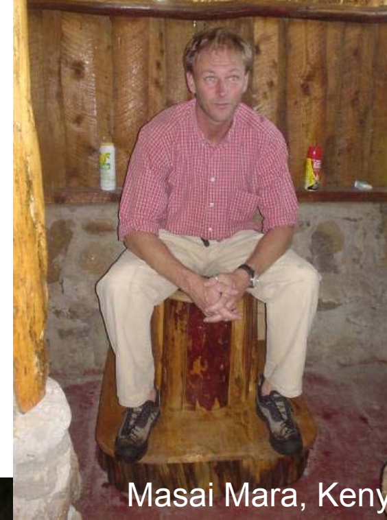
Masai Mara, Kenya