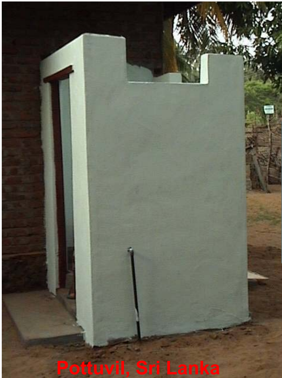
Pottuvil, Sri Lanka